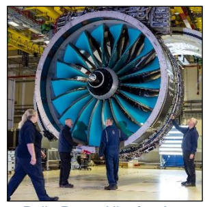
Rolls-Royce Ultrafan Aero Engine Demonstrator

More than 270 organisations belong to the MAA, ranging from global players ITP Aero UK, Parker Meggitt, Moog Aircraft Group, Rolls-Royce and Collins Aerospace to small supply chain companies and key regional partner bodies.