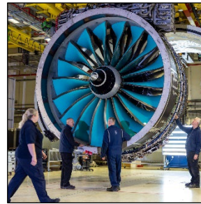
Rolls-Royce Ultrafan Aero Engine Demonstrator

More than 270 organisations belong to the MAA, ranging from global players ITP Aero UK, Parker Meggitt, Moog Aircraft Group, Rolls-Royce and Collins Aerospace to small supply chain companies and key regional partner bodies.