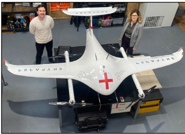
One of 100+ Aerospace UP R&D funding projects, with University of Nottingham