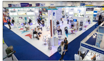
Business was brisk for the 27 companies exhibiting with the MAA at Farnborough