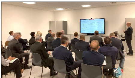
MAA members learn from global aerospace Tier 1 – Parker Meggitt