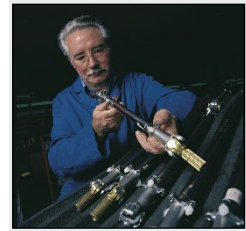
Collins Aerospace Airbus A320 wing flight control system