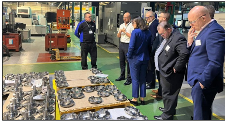
Visit to CBE Plus for MAA AGM