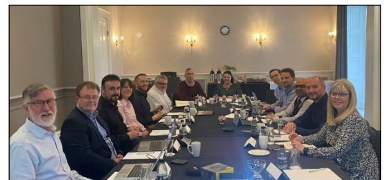
MAA board meeting

EACP EUROPEAN AEROSPACE CLUSTER PARTNERSHIP