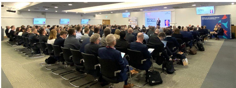
Midlands Aerospace Alliance Annual Conference at the Learning and Development Centre, Rolls-Royce, Derby