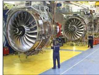
Rolls-Royce Trent 1000 engine for Boeing 787

300 organisations belong to the MAA, ranging from global players Meggitt, Moog Aircraft Group, Rolls-Royce and UTC Aerospace Systems to small supply chain companies and key regional partner bodies. Like the aerospace alliances in other UK clusters, we work closely with the national aerospace body ADS.