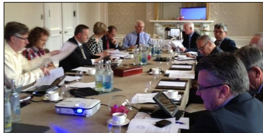
MAA board meeting

In addition, the MAA is a founder and active member of Europe's TransNetAero, a network of aerospace clusters.