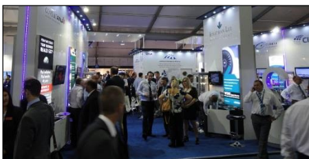
Business is brisk for the 28 companies exhibiting with the MAA at Farnborough 2014