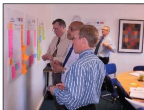
MAA experts teach technology roadmapping to BHR Group