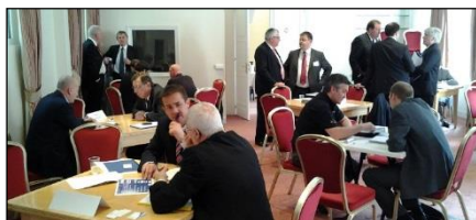
50 1-to-1 meetings for MAA members with French aerospace giant Safran, British embassy, Paris