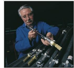
UTC Aerospace Systems Airbus A320 wing flight control system