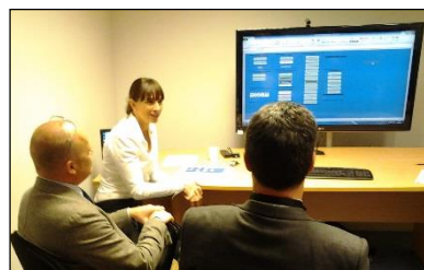
MAA members learn best practice in how to control manufacturing priorities from Meggitt