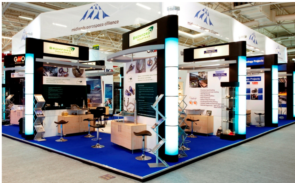
20 "pods" show off MAA members at Paris 2011

Participating in an event of this size with the MAA presents your company to world markets in the most professional way whilst taking away many concerns – costs and time being the main ones.